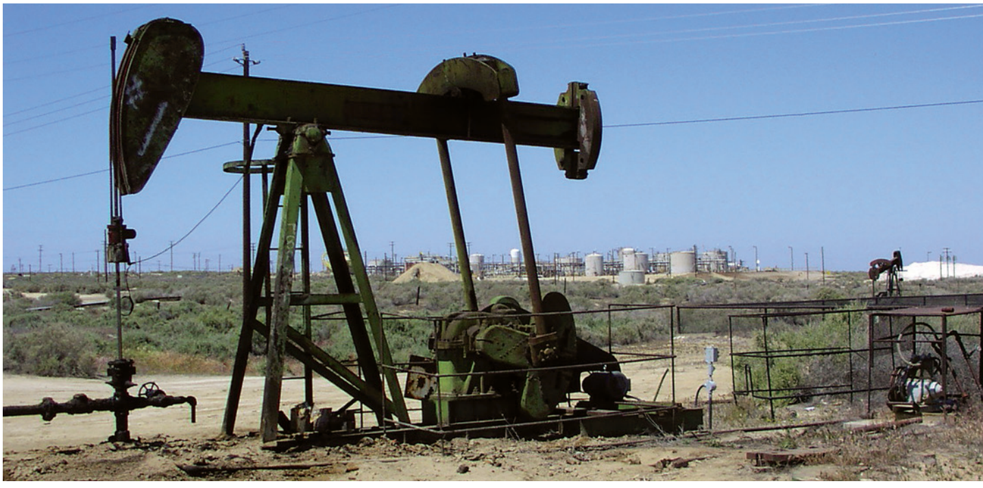
The oil we use is getting dirtier, as companies shift toward more polluting sources of oil and more extreme extraction and refining methods.

being used to assess overall U.S. and global oil production as well as incorporated into lifecycle assessment models for transportation fuels. Working with these models, the Carnegie Endowment has developed the Oil Climate Index, which covers 30 major global oil fields and highlights both the wide variability of different sources of oil and the lack of transparent public information required to make accurate assessment of these oil fields.