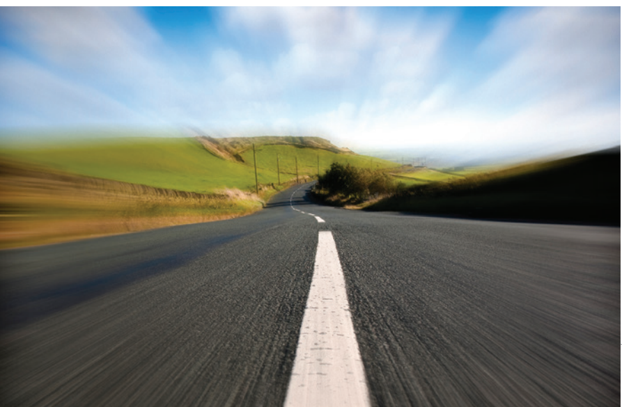
Cutting oil use dramatically is essential to avoiding the worst impacts of climate change, but to achieve a clean transportation future, we must ensure that all of our fuels are as clean as possible.

This report points the way to a cleaner transportation future by describing key ways we can clean up our transportation fuels. This report builds on the UCS Half the Oil plan by explaining how our major transportation fuels are changing and what we can do to reduce emissions from fuel production. Our clean fuels—